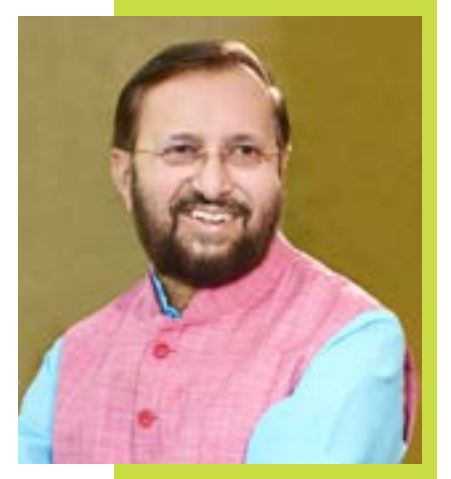
SHRI PRAKASH JAVADEKAR Hon'ble Minister of Environment, Forest & Climate Change and Information & Broadcasting

NARENDRA MODI , Hon'ble Prime Minister of India